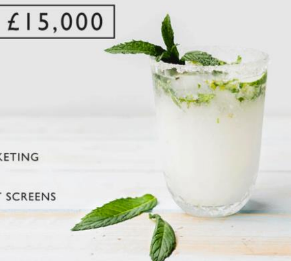
TABLE OF 10

10 TICKETS NETWORKING DRINKS RECEPTION COMPLIMENTARY DRINKS PRIME TABLE POSITION CHAMPAGNE & WINE ON TABLE COMPANY LOGO INCLUDED IN EVENT MARKETING RECOGNITION IN EVENT PROGRAMME COMPANY BRANDING DISPLAYED ON EVENT SCREENS OPTIONAL PRODUCT PLACEMENT